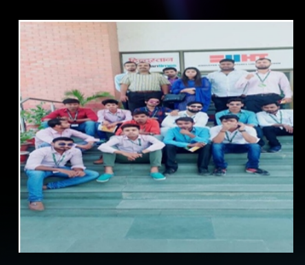
Students at Hindustan Media Venture Ltd.