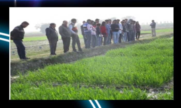
Students at the field

The KVK, Kaushambi has adopted five villages. In these villages the scientists apply their new technology and they observe the changes taking place during five years. In these vil ages they apply their new technology and then they observe all the changes that take place during the five years course. After five years they apply the same technology and methods on different clusters of land. KVK also works as a district knowledge and resource centre. As mentioned above, after the selection of villages, they study about the history of villages with the help of PKA. This is a tool to analyze the village with the help of a questionnaire. Then the soil is tested, and then mapping is prepared from north to south and east to west.