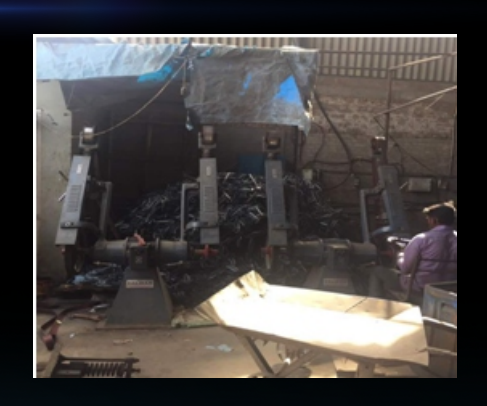
Hook Making Machine in R V Industry

The third day of the visit was made to R. V. Industries established in 2007, it is a perfect example of Small Scale Industry it is located in Chinhat, Lucknow (U.P) which is known as the Industrial area of Lucknow. R.V. Industries manufacture safety equipments like Scuffle hooks, rock climber safety belts and other such mechanical devices used for trekking. It exports 90% of its products to countries like the USA, Malaysia etc. the staff showed the students these equipments and also demonstrated how to use them, Also CNC machine and the process for mailing these equipments was shown to the students. The students got a chance to transfer their theoretical knowledge to practical implication.