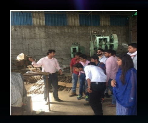
Students at RV Industry